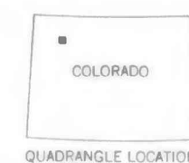
PLATE 10 AREAL DISTRIBUTION AND IDENTIFIED RESOURCES MAP OF NON-ISOPACHED COAL BEDS