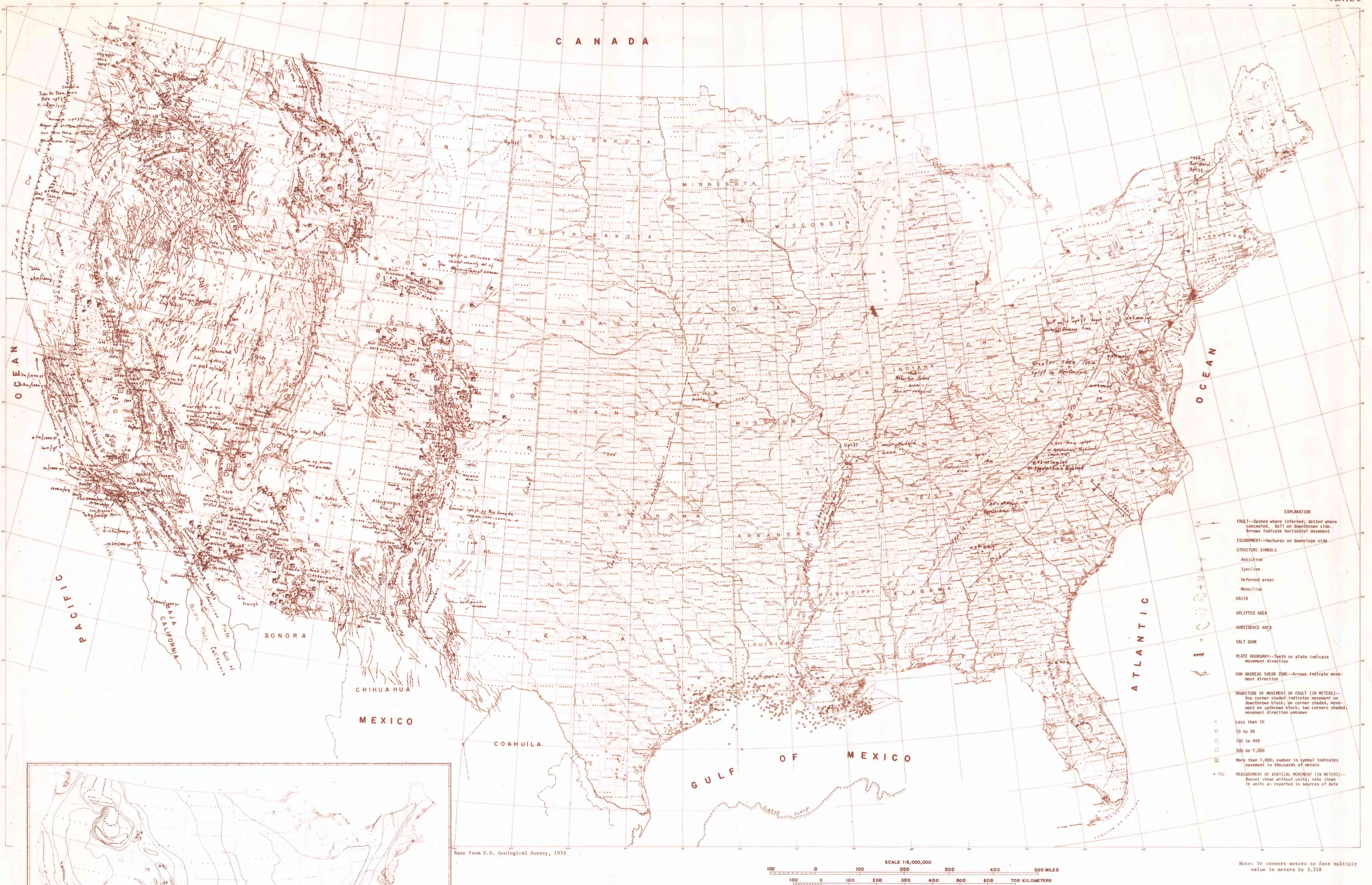
PLATE 2--MAP OF NEOTECTONICS, RATES, AND MAGNITUDE OF VERTICAL MOVEMENTS IN THE UNITED STATES OVER THE LAST 10 M.Y.