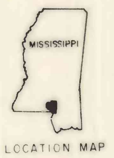
Figure 3.--Location of surface-water and ground-water sampling sites in Marion and Lamar Counties, Mississippi.