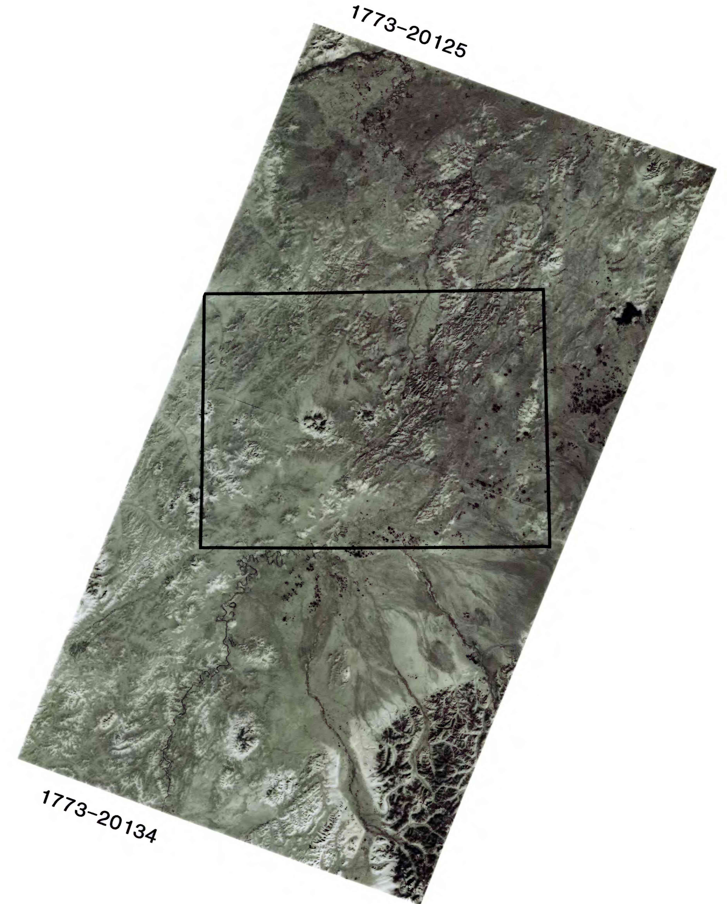
Figure 2. Example of Landsat imagery used in analyses of the Medfra quadrangle. Band 7. Quadrangle boundaries shown in dark lines.

BASE FROM U.S. GEOLOGICAL SURVEY, 1953, 1959