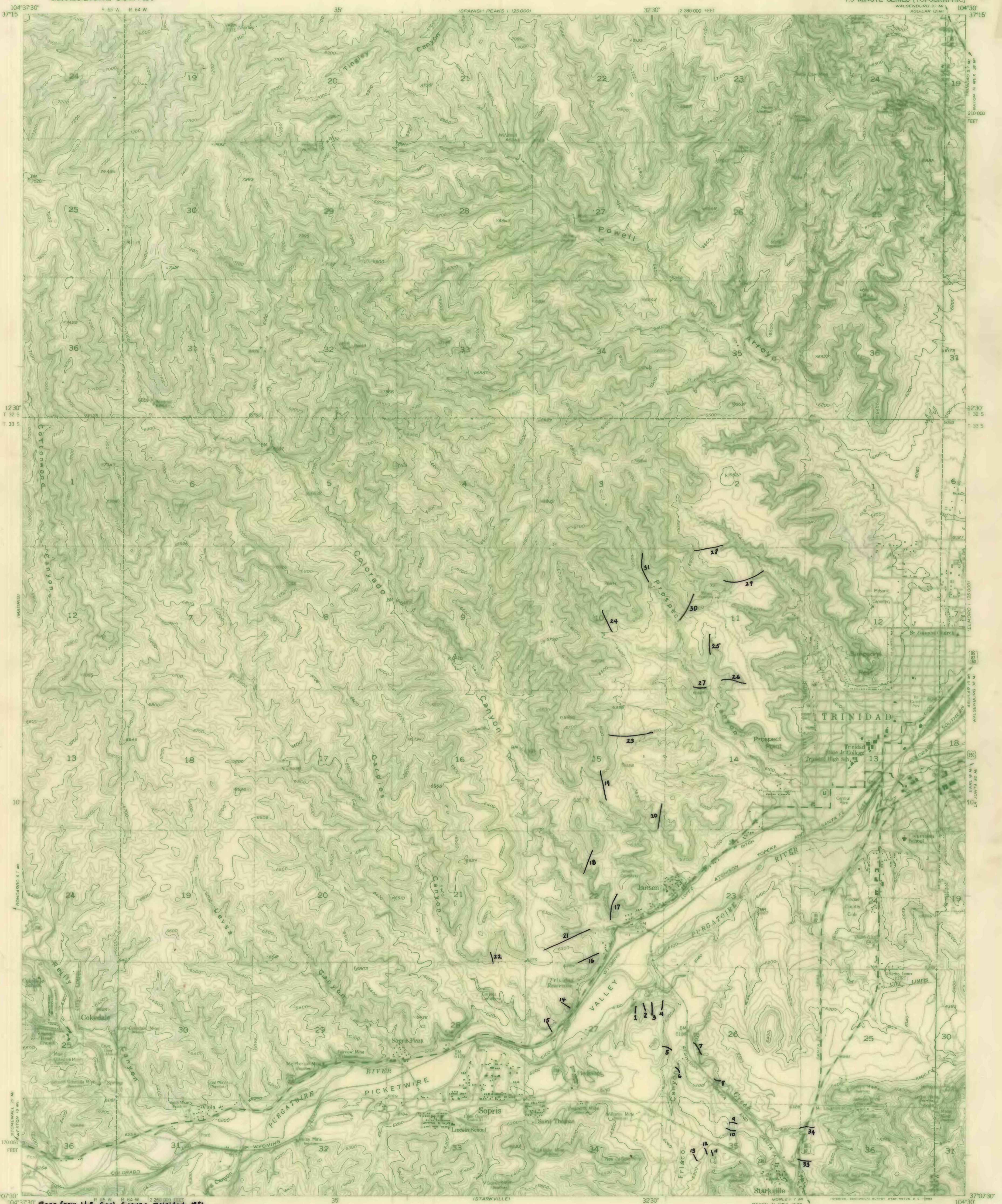
PLATE I.-- LOCALITIES OF MEASURED SECTIONS NUMBERED 1 THROUGH 31, 33 AND 34