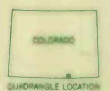
PLATE 6.--LOCALITIES OF MEASURED SECTIONS NUMBERED 51 AND 52

THIS MAP COMPLIES WITH NATIONAL MAP ACCURACY STANDARDS FOR SALE BY U.S. GEOLOGICAL SURVEY, DENVER, COLORADO 80225, OR RESTON, VIRGINIA 22092 A FOLDER DESCRIBING TOPOGRAPHIC MAPS AND SYMBOLS IS AVAILABLE ON REQUEST