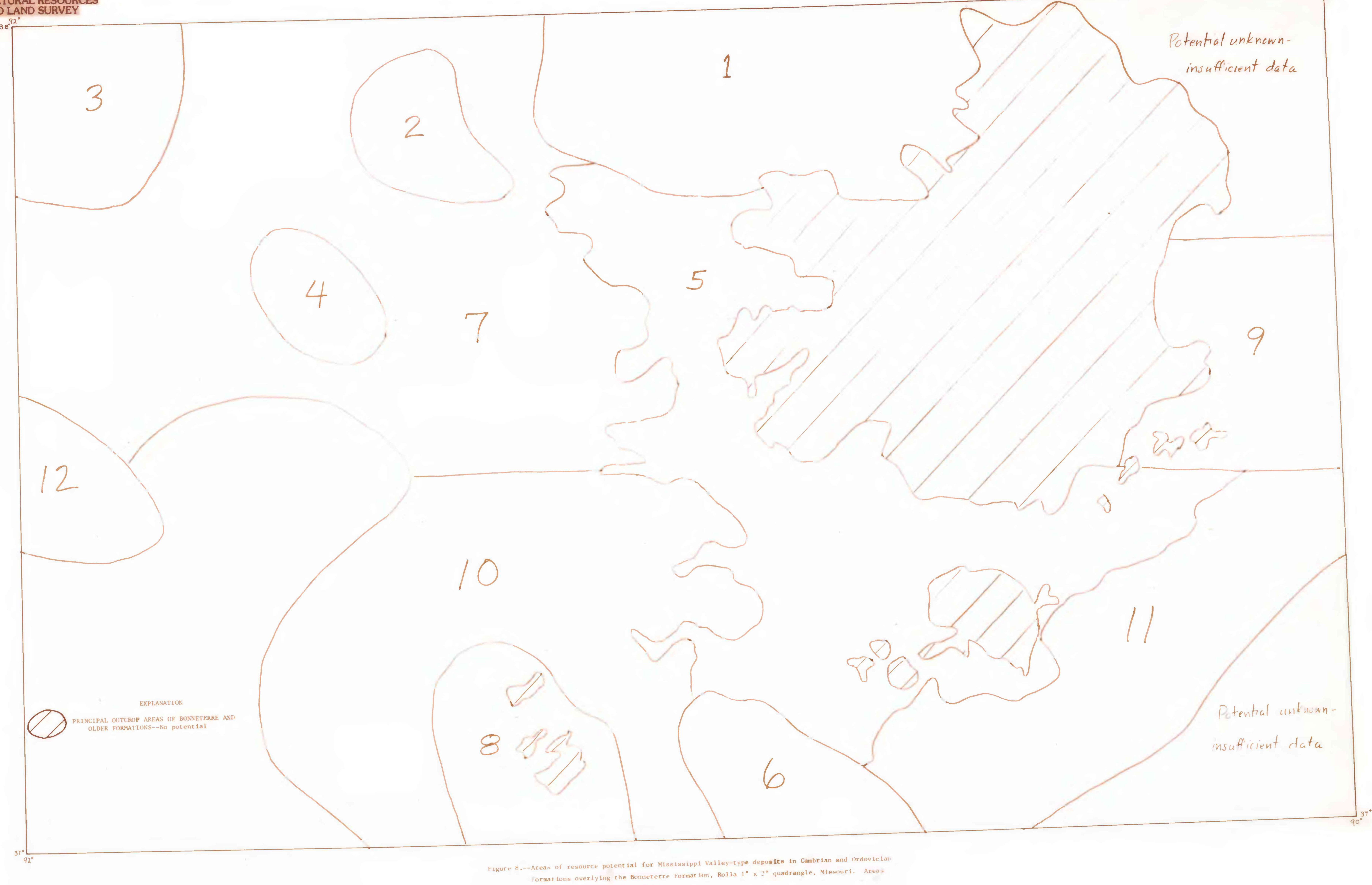
Figure 8.—Areas of resource potential for Mississippi Valley-type deposits in Cambrian and Ordovician formations overlying the Bonnetate Formation, Belle 1" x 2" quadrangle, Missouri. Areas numbered are described in table 1.