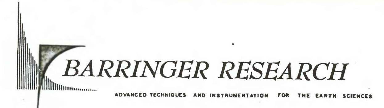
PLATE E II