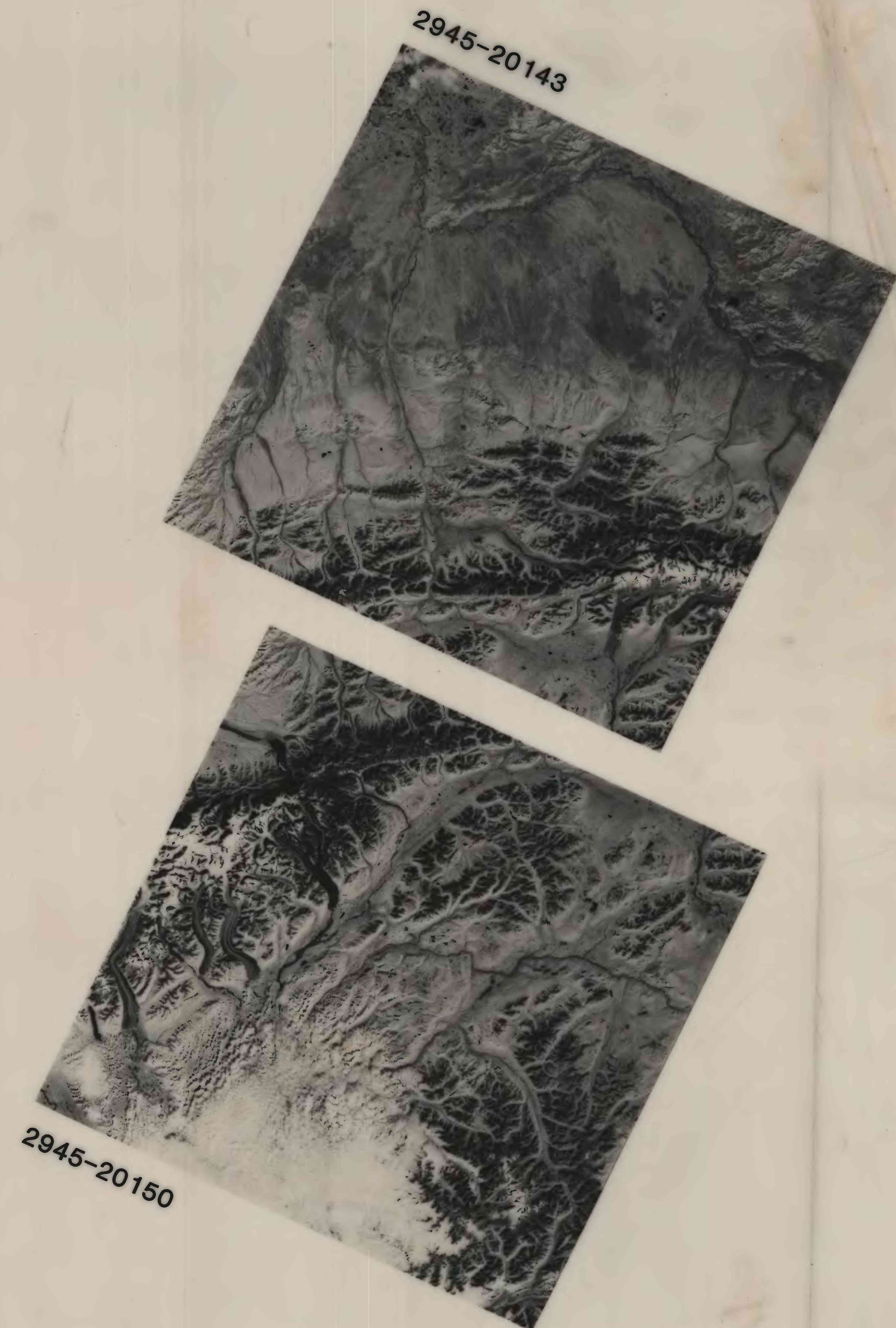
Figure 2. Example of Landsat imagery used in analyses of the Healy quadrangle. Band 7.