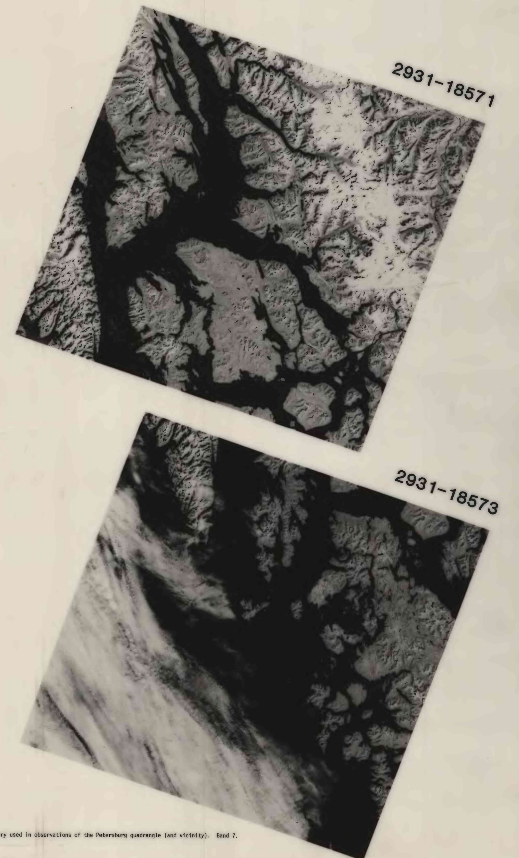
Figure 2. Example of Landsat imagery used in observations of the Petersburg quadrangle (and vicinity). Band 7.