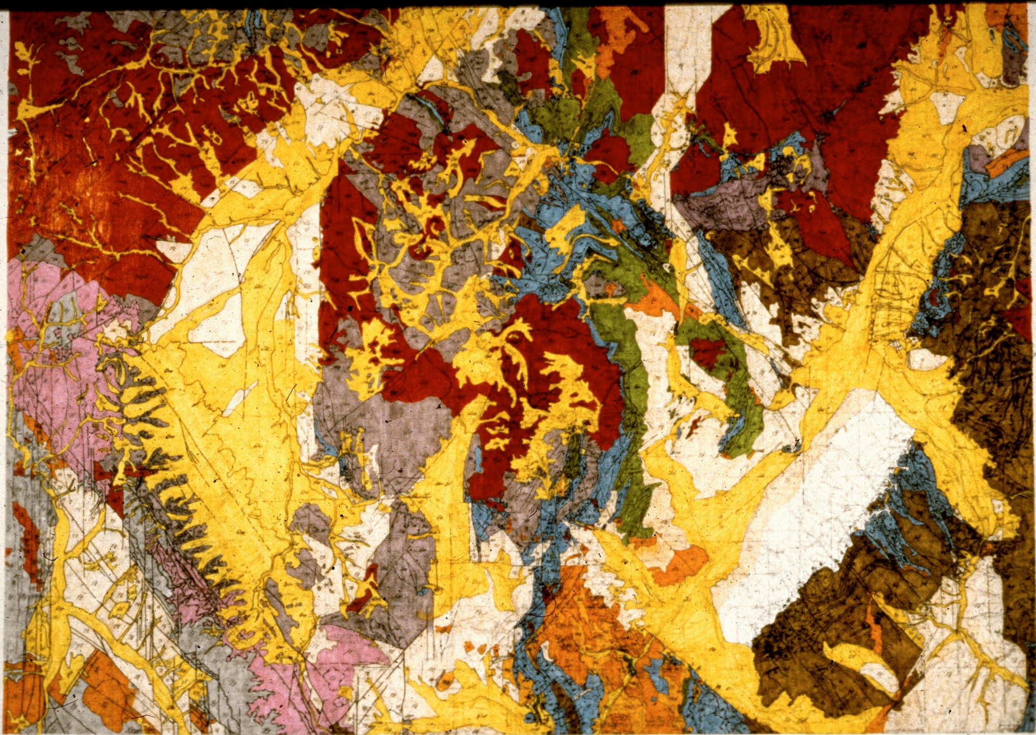
PRELIMINARY GEOLOGIC MAP OF DILLON QUADRANGLE