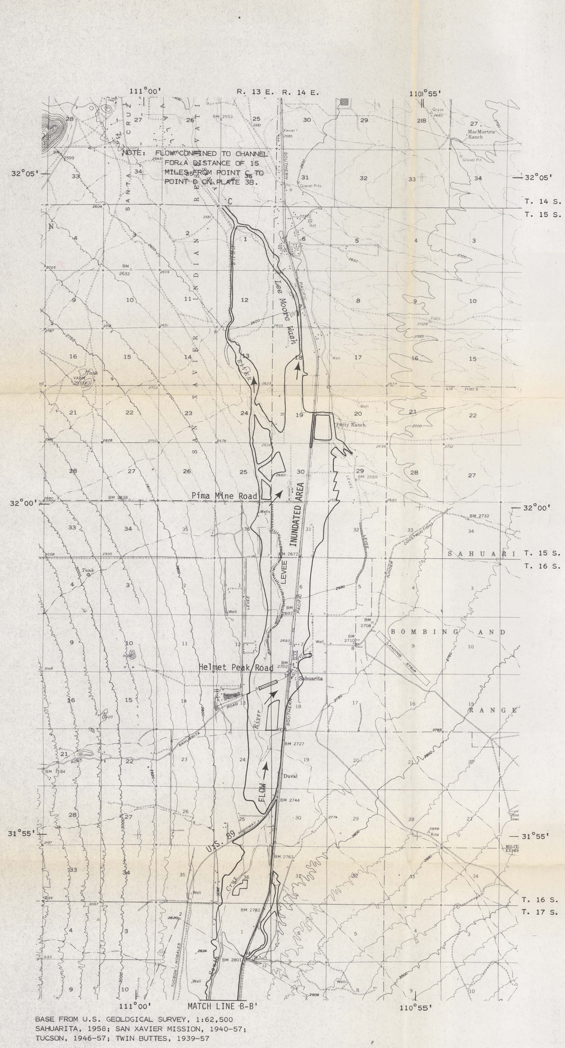
A. GREEN VALLEY TO SAN XAVIER INDIAN RESERVATION