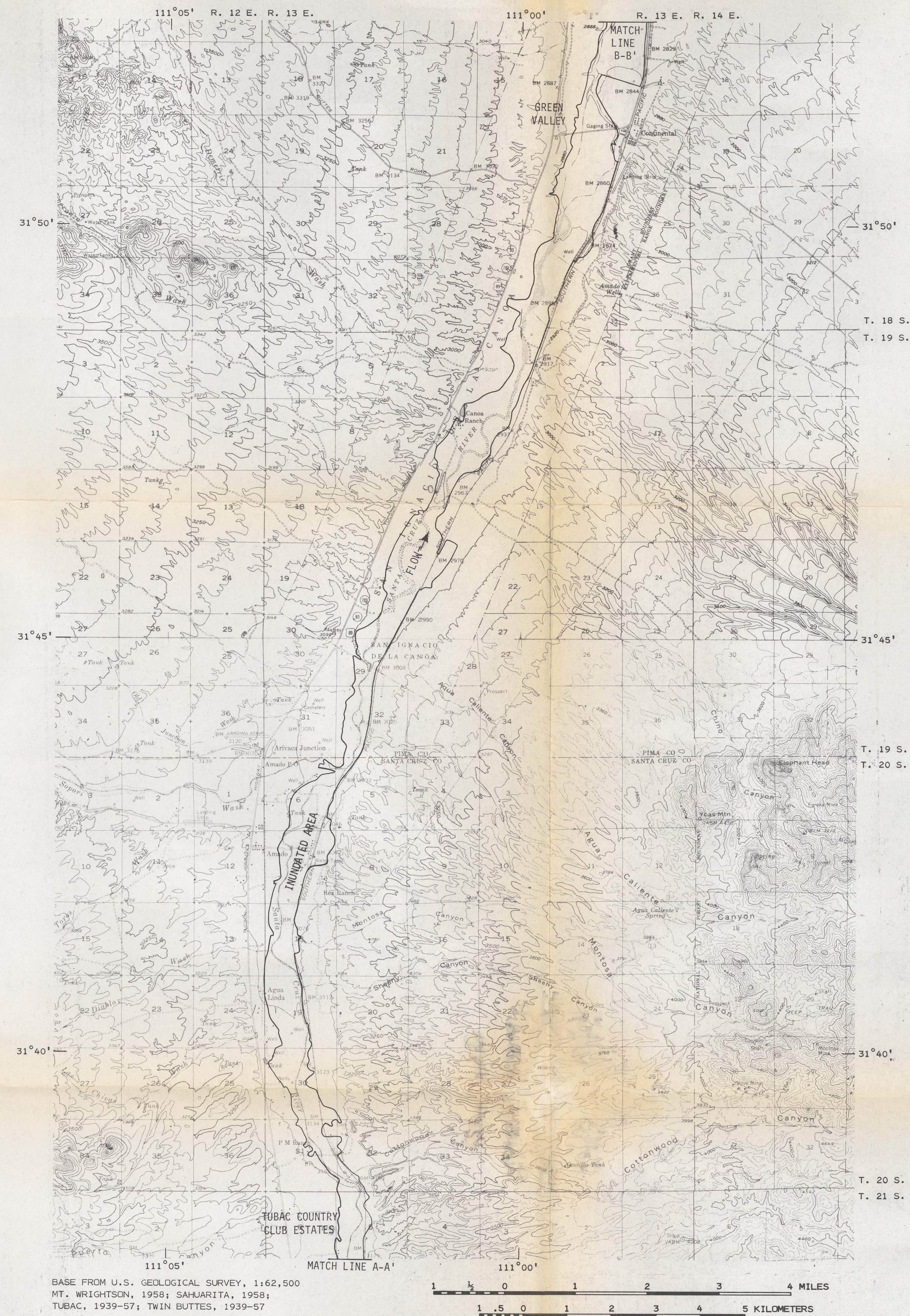
B. TUBAC COUNTRY CLUB ESTATES TO GREEN VALLEY