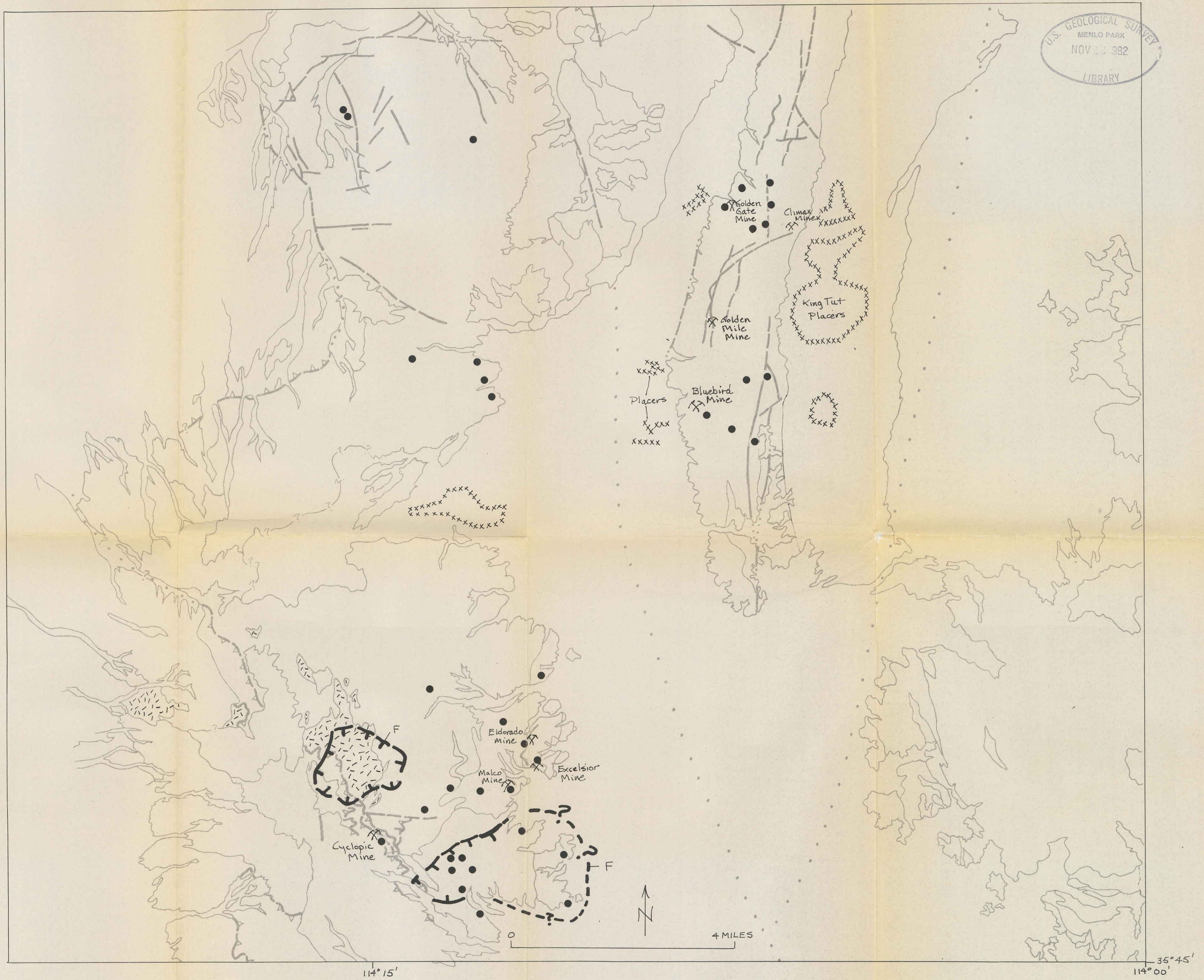
Figure 3.--Location of major mines that are credited with the production of metal(s) and known occurrences of gold in the Gold Basin-Lost Basin mining districts. Spot indicates locality of lode gold collected for this report, or observed (Blacet (1975). See also the section by Antweiler and Campbell in this report and fig. 65). Major-placer workings also indicated. F, outer limit of widespread occurrences of fluorite observed either in veins or disseminated in the upper Cretaceous two-mica monzogranite (patterned).