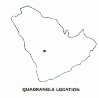
MAP OF THE JANBAN QUADRANGLE, SHEET 20/44 B, KINGDOM OF SAUDI ARABIA, SHOWING SAMPLE LOCATIONS, ROCK TYPES, AND GEOGRAPHIC AND CULTURAL FEATURES by Maurice R. Brock 1984