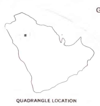
MAP OF THE ZARGHAT QUADRANGLE, SHEET 26/40 B, KINGDOM OF SAUDI ARABIA SHOWING SAMPLE LOCALITIES, AND GEOGRAPHIC AND CULTURAL FEATURES