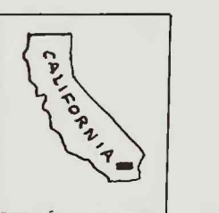
LOCATION OF STUDY AREA