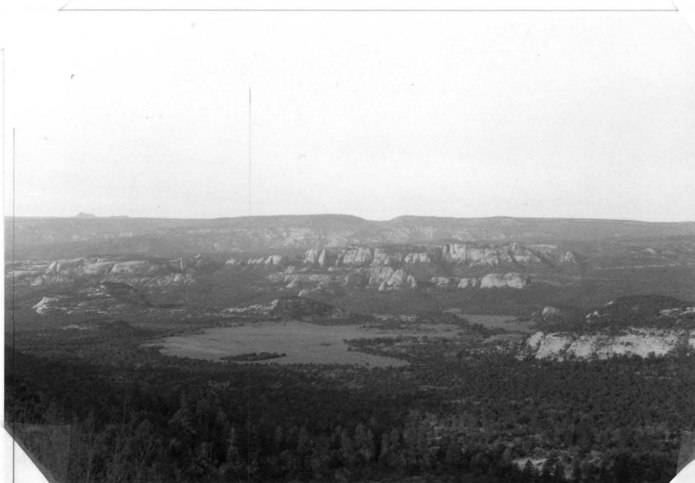
Figure 11.—View of the headwaters area of Cottonwood Wash, referred to as the Chippean Rocks (T. 34 S., R. 20-21 E.). The Navajo Sandstone crops out in the center of the photograph. This is an area of recharge to the N aquifer. Elk Ridge is along the horizon. The meadow in the middle ground is underlain by alluvium.