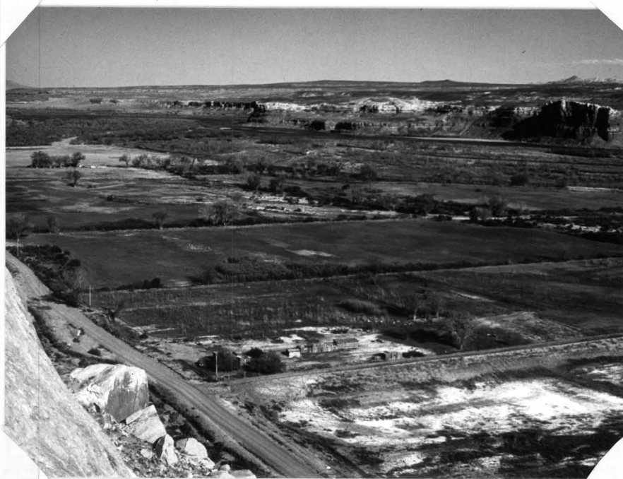
Figure 17.—View of the San Juan River valley, looking upstream near Bluff. The valley typically is this wide upstream into Colorado. The Bluff Sandstone member of the Morrison Formation forms the conspicuous cliffs on either side, but the Summerville Formation, of former usage (now designated Wanakah Formation) crops out at the base of the cliff. The valley is irrigated with surface water diverted from the San Juan River supplemented with ground water from flowing wells completed in the N aquifer. Photograph taken about 1962 by unknown photographer.