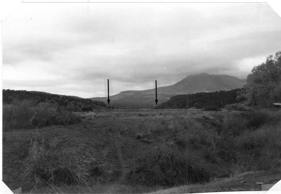
Figure 8.—View looking upvalley along Verdure Creek, south of Monticello. Bounding faults (marked by arrows) on either side of the valley form a graben valley. The sides of the valley are formed by the Dakota Sandstone and Burro Canyon Formation, But the valley bottom is covered with alluvium. The Abajo Mountains are in the background.