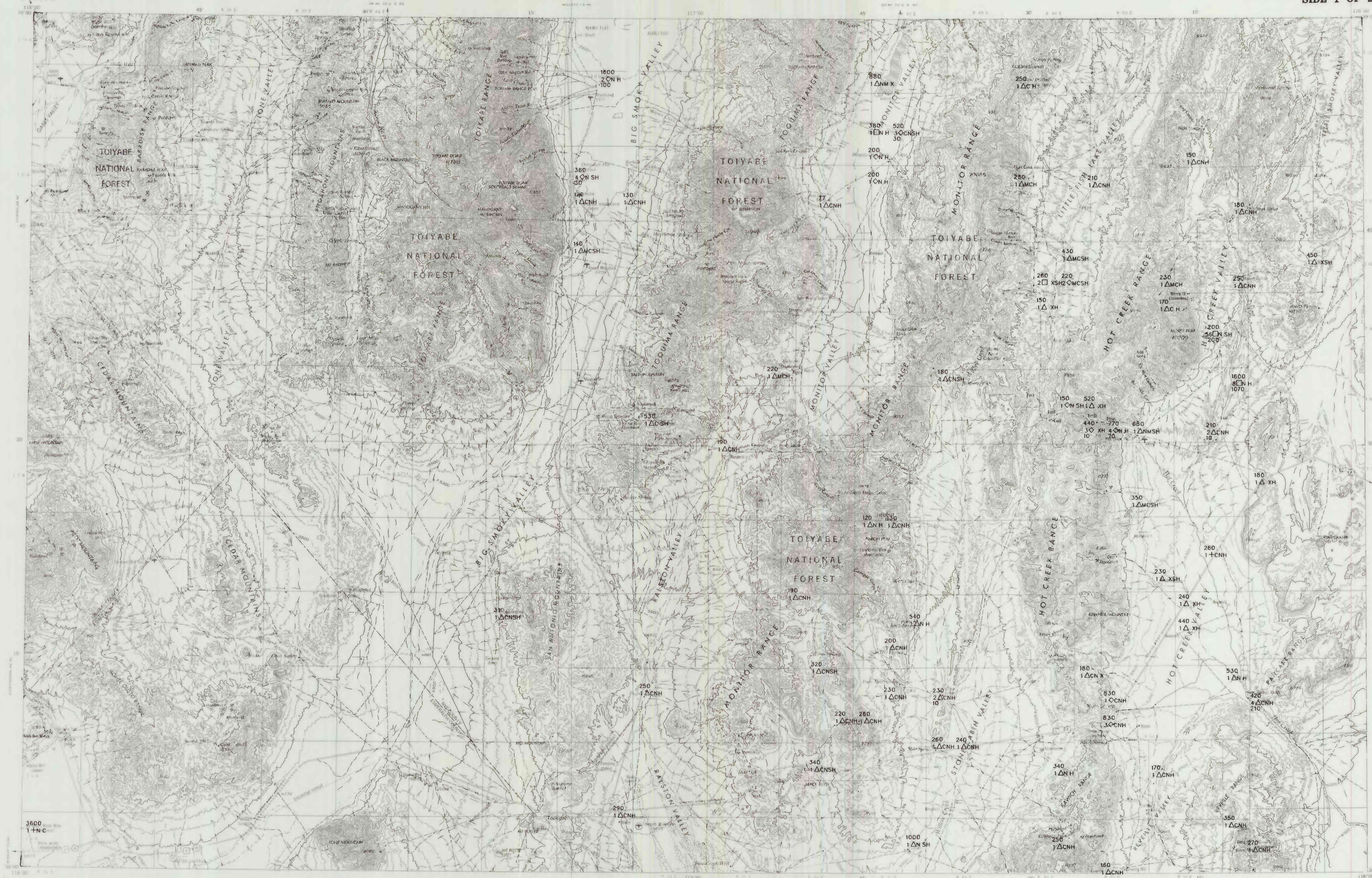
Base from U.S. Geological Survey Tonopah, 1956