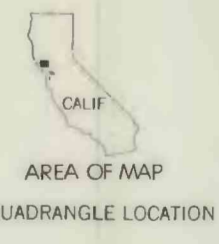
Healdsburg 15 minute Quadrangle

Base from U.S. Geological Survey Geyserville Quadrangle, 1955, 1:24,000