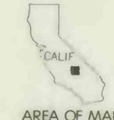
PLATE 1. MAP SHOWING LOCATIONS OF SAMPLING SITES IN THE SOUTH SIERRA WILDERNESS AND THE SOUTH SIERRA ROADLESS AREA