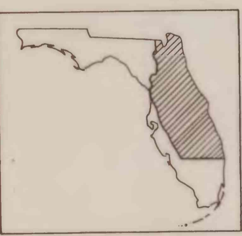
LOCATION OF MAP AREA

NOTE: The potentiometric contours are generalized to portray synoptically the head in a dynamic hydrologic system taking due account of the variations in hydrogeologic conditions such as differing depths of wells, nonsimultaneous measurements of water levels, variable effects of pumping, and changing climatic influence. The potentiometric contours thus may not conform exactly with individual measurements of water level.