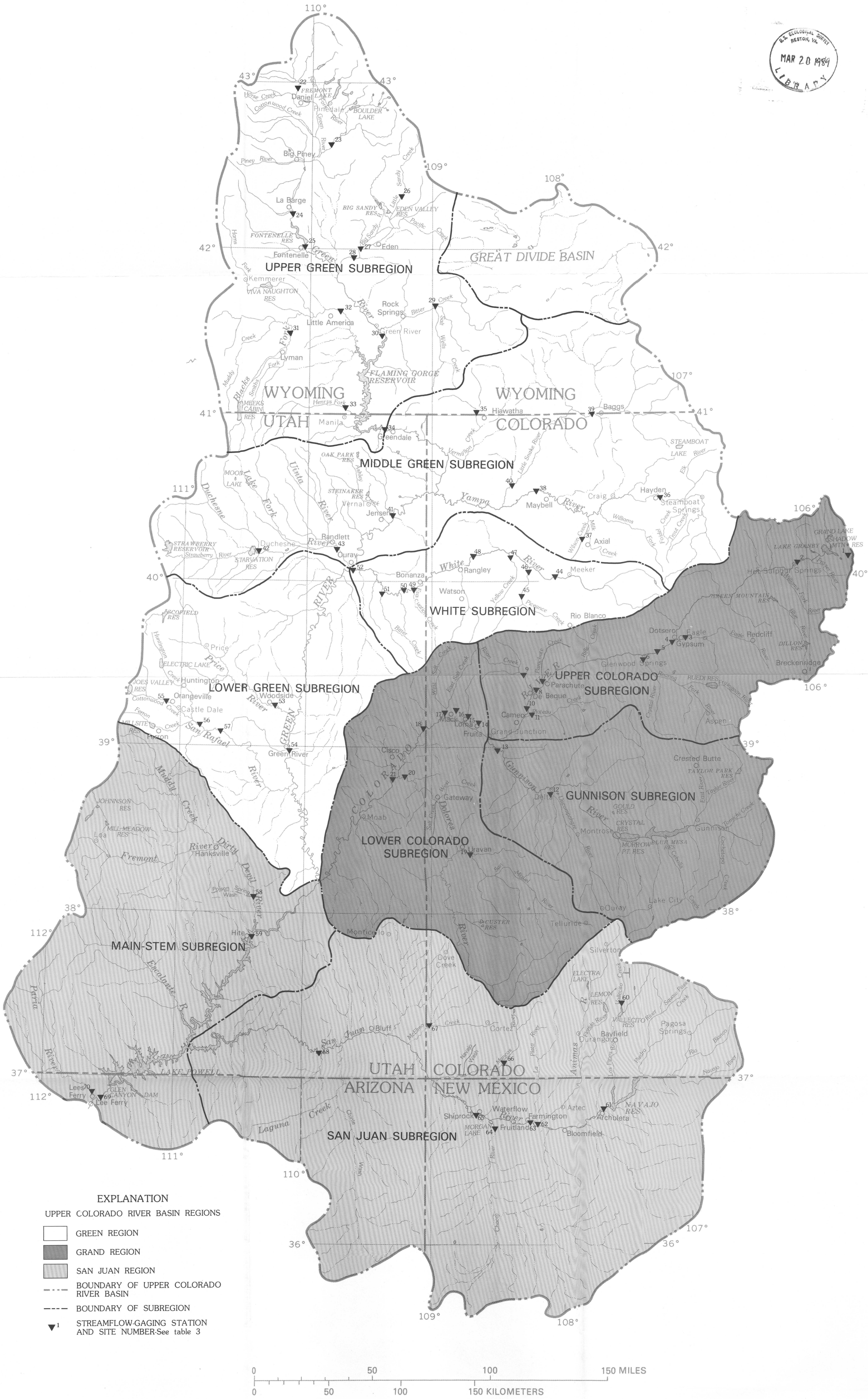
MAP SHOWING THE UPPER COLORADO RIVER BASIN REGIONS, SUBREGION BOUNDARIES, AND LOCATION OF STREAMFLOW-GAGING STATIONS