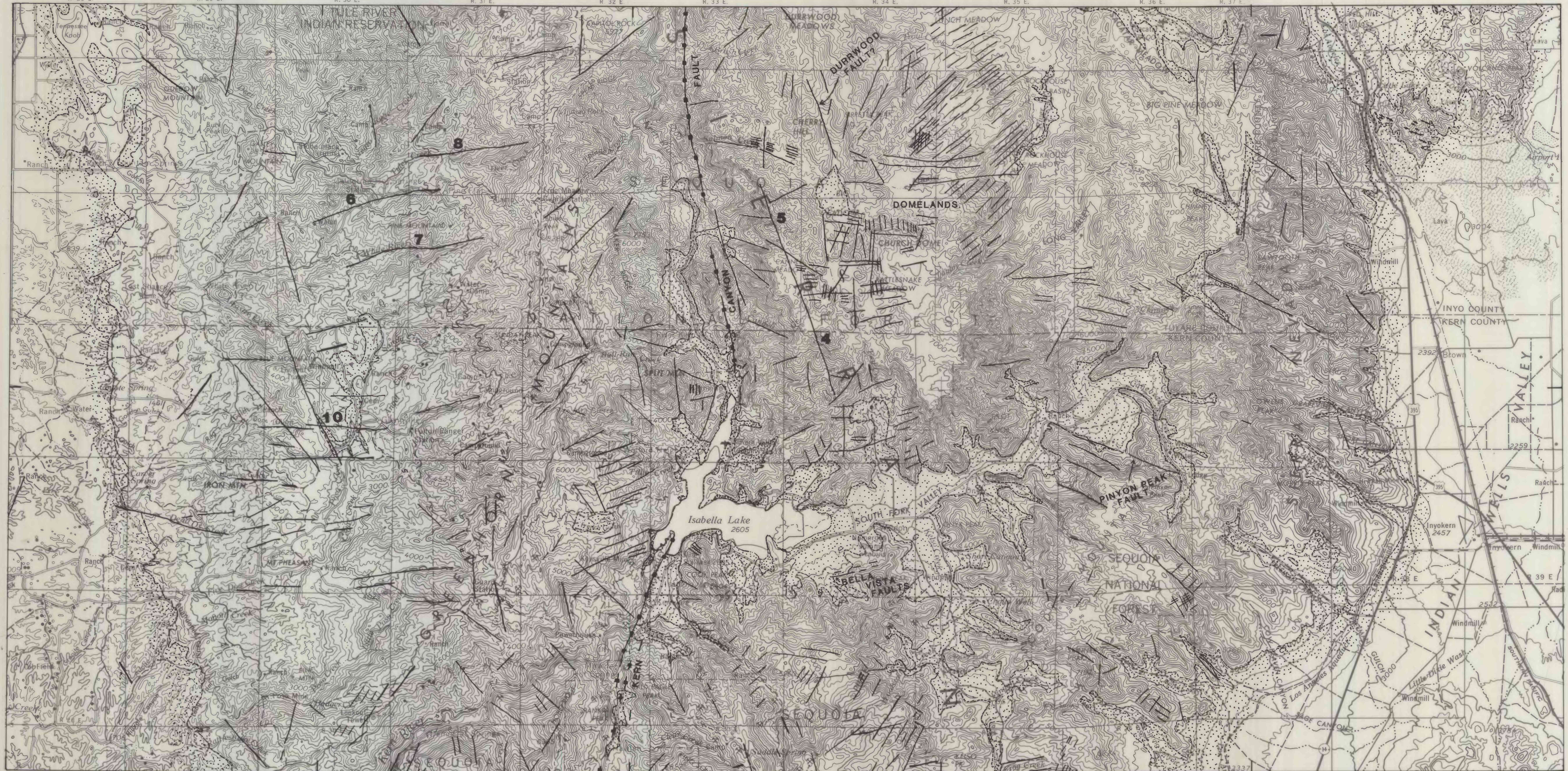
AIR PHOTO LINEAMENTS, SOUTHERN SIERRA NEVADA, CALIFORNIA