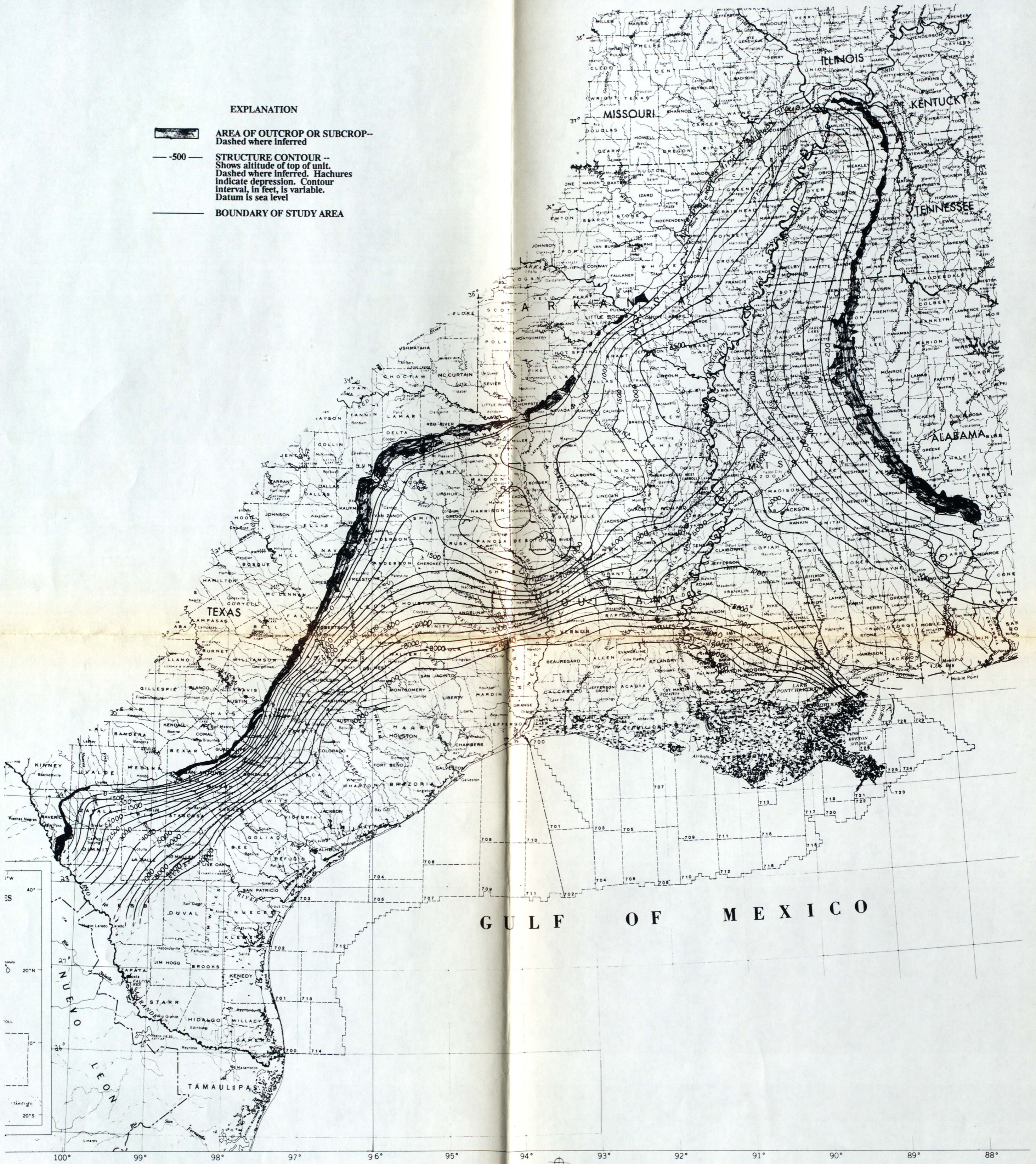
Figure 16 .-- Altitude and configuration of the top of the Midway Group.