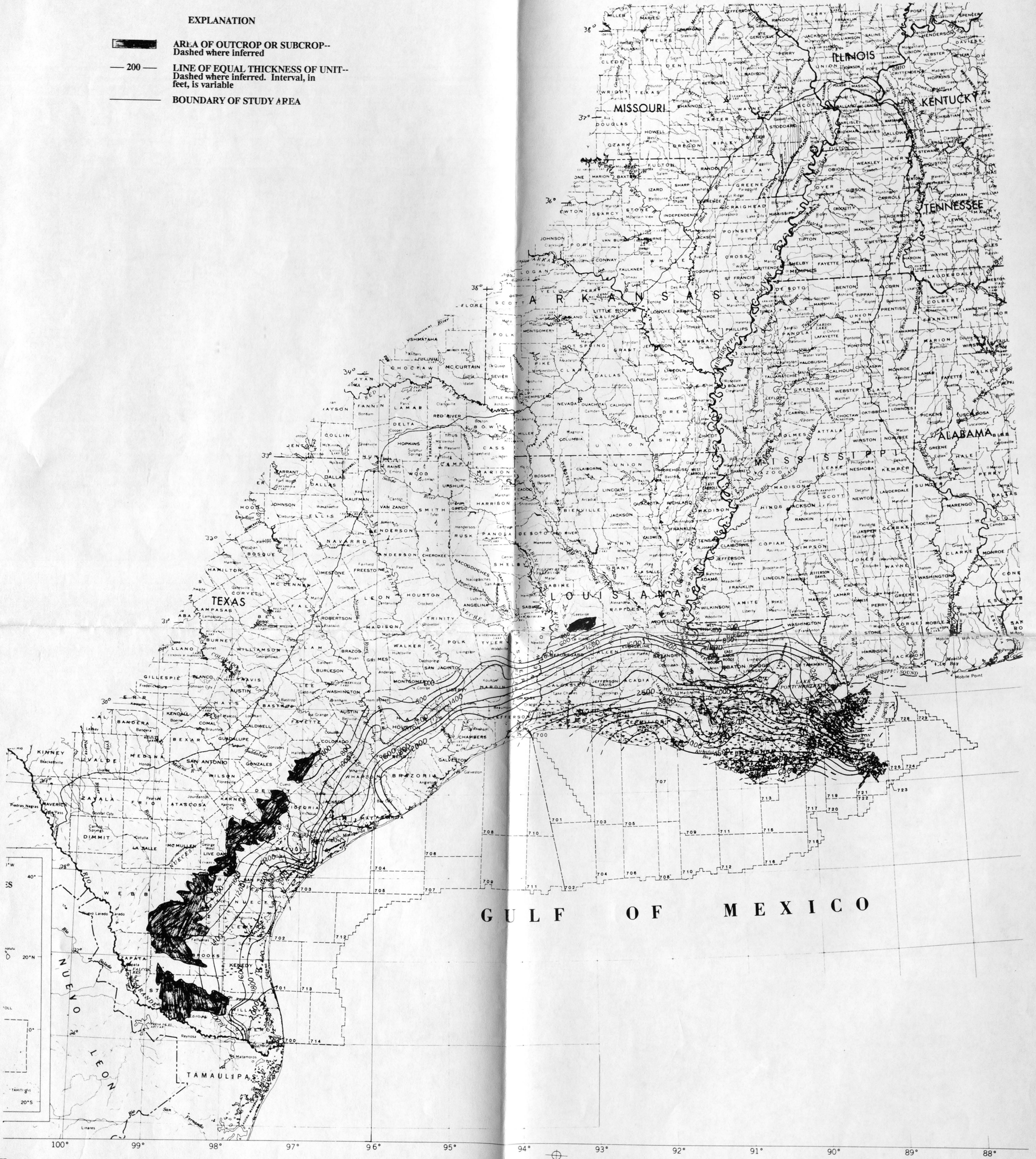
Figure 35. -- Thickness of Pliocene deposits, undifferentiated.