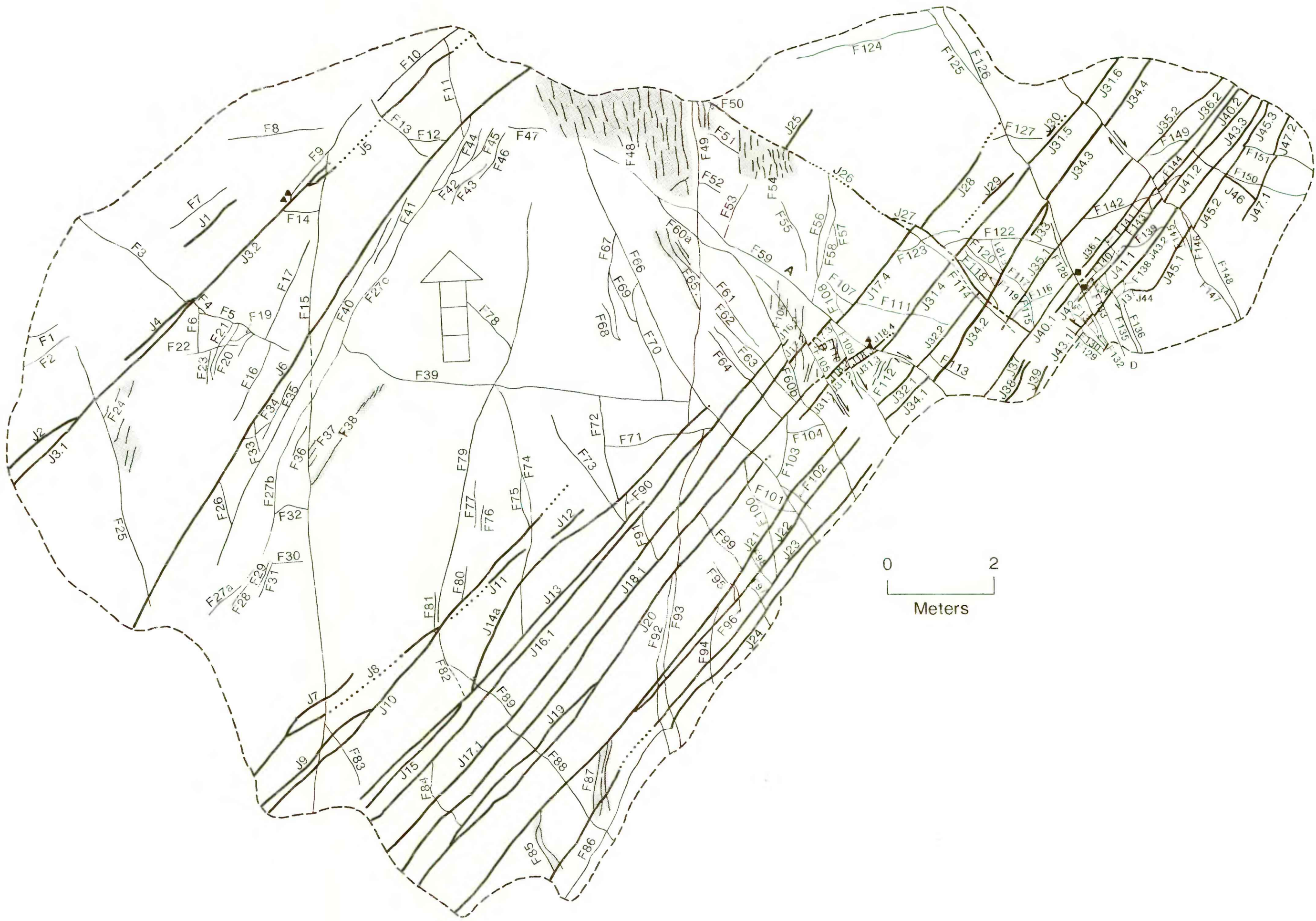
Pavement 100 (area=214 meters 2 )