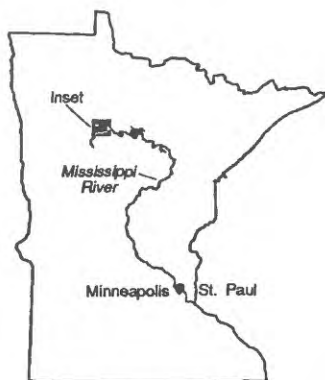
Figure 1. -- Location of research site near Bemidji, Minnesota

SCALE 0 1 2 3 4 5 Kilometers 0 1 2 3 4 Miles