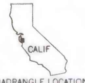
Sheet 6. MINDEGO HILL QUADRANGLE