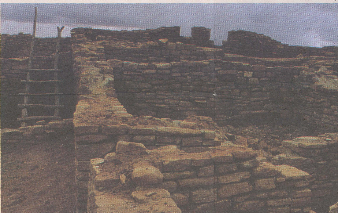
Lovely Ruins