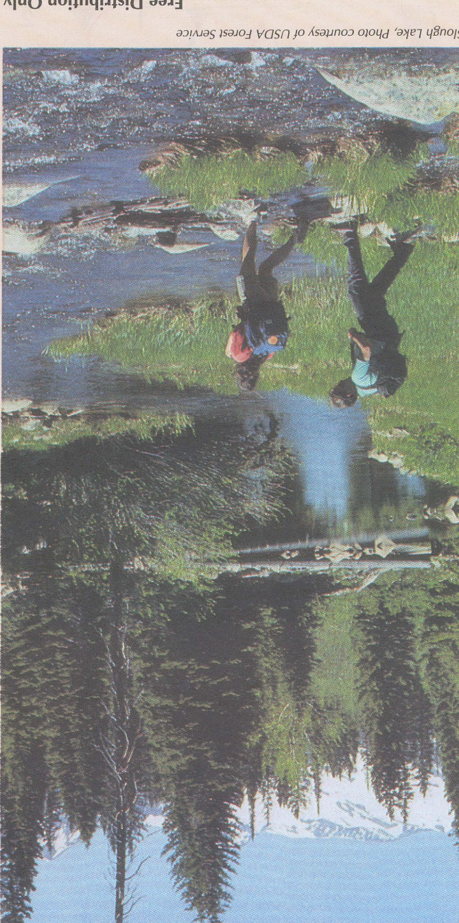
Arkansas River, Photo courtesy of Bureau of Land Management