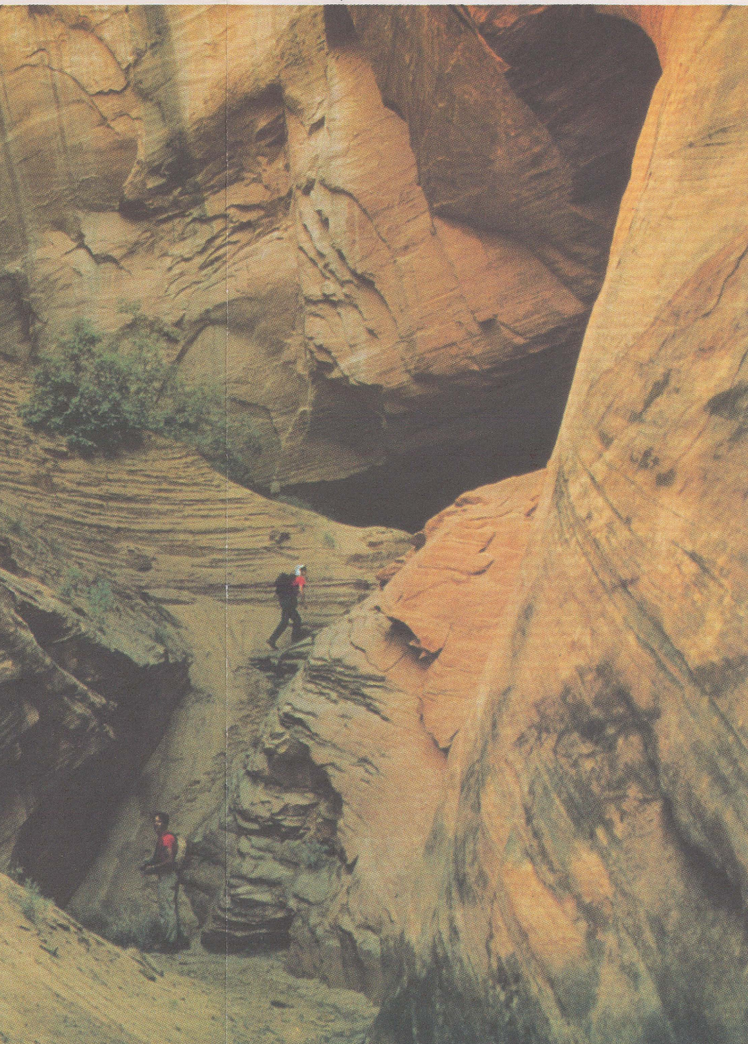
Lost Lake Slough