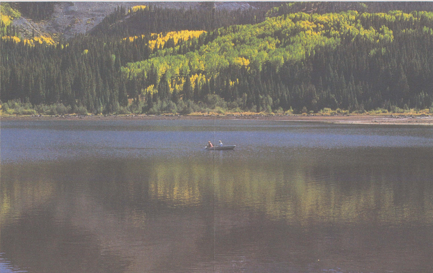
Bull Canyon