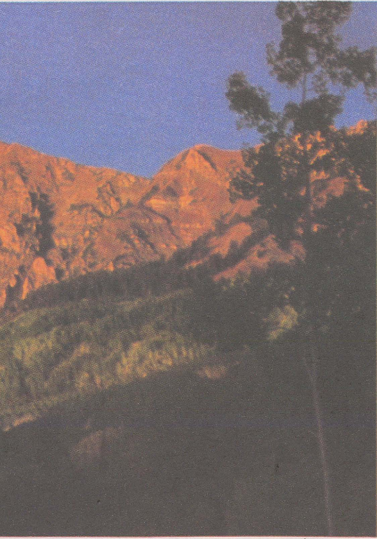
Kibler Pass