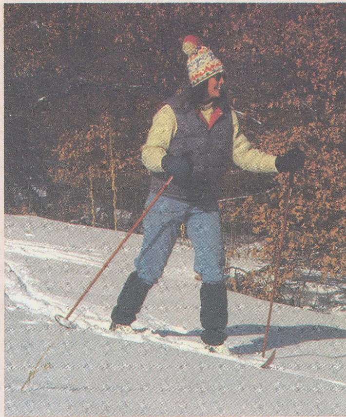
Castlewood State Park