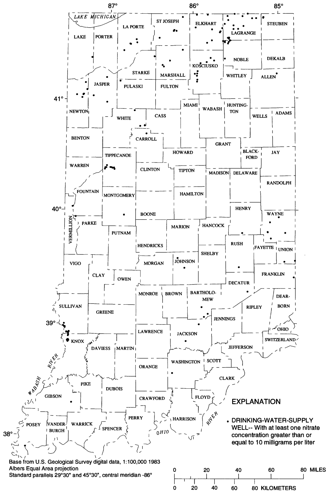
Figure 1. Locations of drinking-water-supply wells in Indiana with nitrate concentrations greater than or equal to 10 milligrams per liter during 1973-91.