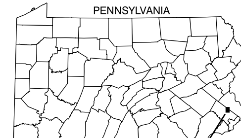
LOCATION OF MAPPED AREA