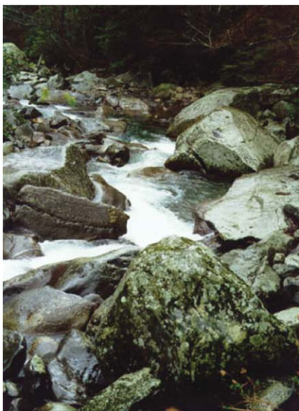
C) West Prong of the Little Pigeon River (elev = 3040 ft, Mt. Le Conte quadrangle).