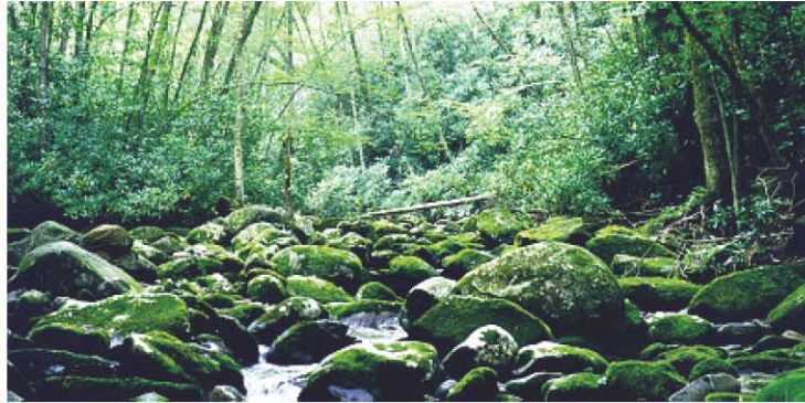
A) Rowans Creek (elevation 2400 ft, Cades Cove quadrangle).

Fig. 15- Coarse alluvium consists of boulders of metasandstone that remain as a lag deposit as water removes fine material and reworks older boulder debris deposits. Examples are shown below.