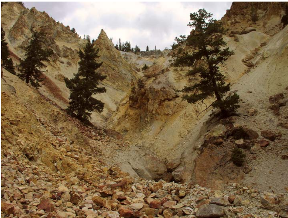
Figure 2a. Photo of Hottentot Ck. alteration scar.