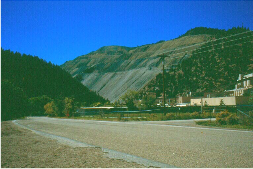
Figure 3b. Photo of Sugar Shack South, Sugar Shack Middle and Sulphur Gulch waste piles taken from highway near the Red River.