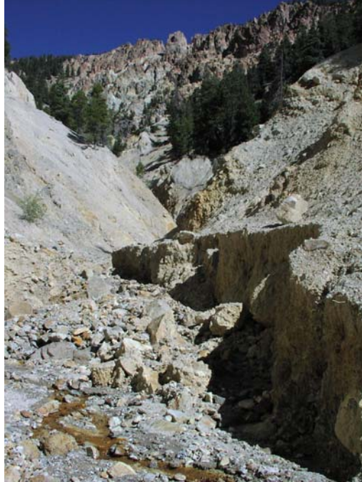
Figure 2b. Photo of the upper reach of Hansen Ck. alteration scar.