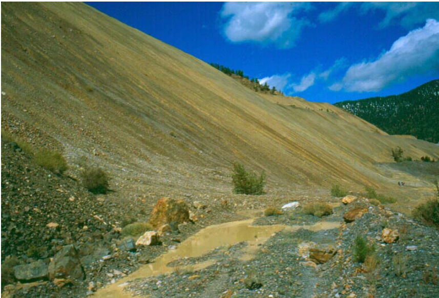
Figure3a. Photo of upper bench of Sugar Shack South waste pile.