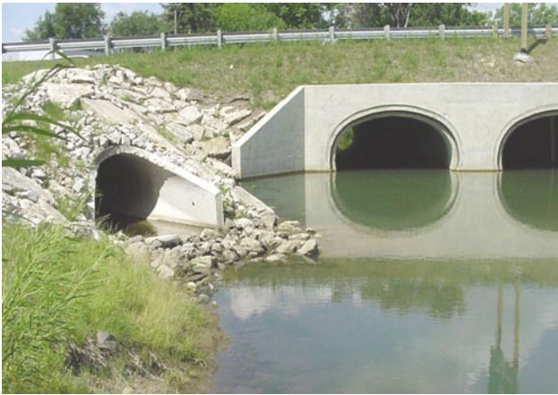
Figure 2. Culvert, riprap, and drain downstream from the intersection of Zeeb Road and Honey Creek (site 15), Washtenaw County, Mich., July 29, 2003.

seepage runs were made during good weather when there was no wet atmospheric input into the watershed. From potential evapotranspiration values published on the World Wide Web by Michigan Automated Weather Network (Michigan State University, 2003), estimated instream evapotranspiration in the time between upstream and downstream measurements was estimated as two or more orders of magnitude less than the streamflow in Honey Creek, and therefore was considered negligible for gain-loss computations.