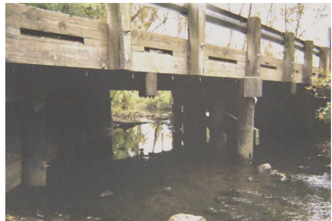
Figure 3. Bridge at site 4, Honey Creek at Pratt Rd near Ann Arbor, Mich., on September 10, 2003.

Because the treatment discharge was much larger than the streamflow at site 14, fluctuations in this discharge could have masked any loss or gain in this reach. For this