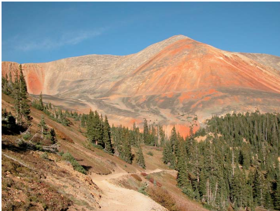
Figure 3. Red Cone Mountain in the upper reaches of Handcart Gulch, CO, 12,800 feet. Note the red staining from the oxidation of pyrite at concentrations of nearly ten percent of the rock mass. This is the primary and natural source of low pH water in the watershed. The upper road cuts across a major rock glacier and was excavated by Mineral Systems Inc. to drill the reconditioned exploration holes WP 3 and WP 4.