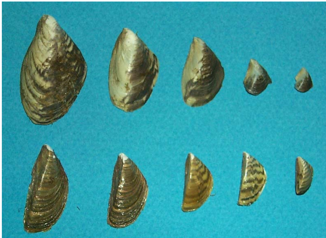
Figure 1: Quagga mussels ( Dreissena bugensis , top row) and zebra mussels ( Dreissena polymorpha , bottom row).

Nonnative zebra and quagga mussels ( Dreissena polymorpha and Dreissena bugensis , respectively; fig. 1) were accidentally introduced to the Great Lakes in the 1980s and subsequently spread to watersheds of the Eastern United States (Strayer and others, 1999). The introduction of Dreissena mussels has been economically costly and has had large and far-reaching ecological impacts on many freshwater ecosystems.