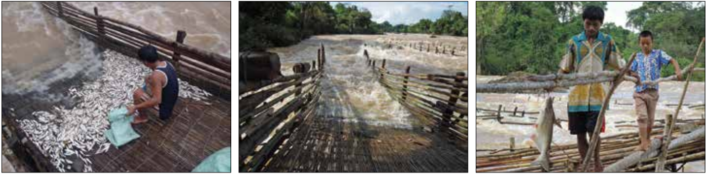
Figure 2. Fishers attend to lli traps near Khone Falls, Lao People's Democratic Republic (Lao PDR), in June 2012.

Representatives from governments, universities, NGOs, and the MRC were convened to discuss the proposed Network, which could address the need to collect, store, and analyze fisheries data with a consistent approach. The initial goals of the Network were as follows: