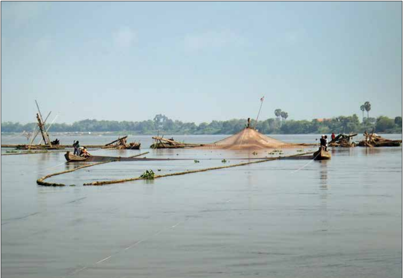
Figure 1. Fishers haul in a dai net on the Tonle Sap River in Cambodia on February 11, 2012.

One example of current fisheries monitoring in the LMB is the commercial dai fishery in Cambodia. This is a large, highly specialized fishery that takes advantage of the substantial migrations of fish in the Tonle Sap and Mekong Rivers. A dai is a bag net with a small mesh size (less than 25 millimeters [mm]) (Sverdrup-Jensen, 2002). Several dai nets are arranged in a series across the width of the river; the fish are retrieved from the cod end by boat and then are deposited onto an associated barge (fig. 1). During the peak season, a single net can haul up to 0.5 metric tons of fish every