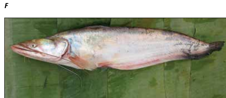
Figure 3. Some of the fish listed as important Mekong River species during Small Group Session 1. A, Barbonymus gonionotus . B, Labeo chrysophekadion . C, Channa striata . D, Pangasius macronema . E, Mastacembelus armatus . F, Wallago attu .