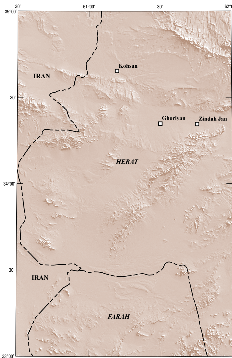
Figure 1.—Provinces and selected cities, towns, and villages in the map area. Topography is shown as shaded relief.