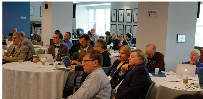
Figure 19. Attendees consider the paths forward.

How do we recognize success? Has this issue been addressed in the past? We need a framework to evaluate future work (fig. 19). What are the metrics? What are the measures of progress (rather than success)? More agreement on methodologies would be useful. It is important to talk to decisionmakers and ask what they need. National security geospatial databases should not be ignored, as some cleared researchers may extract