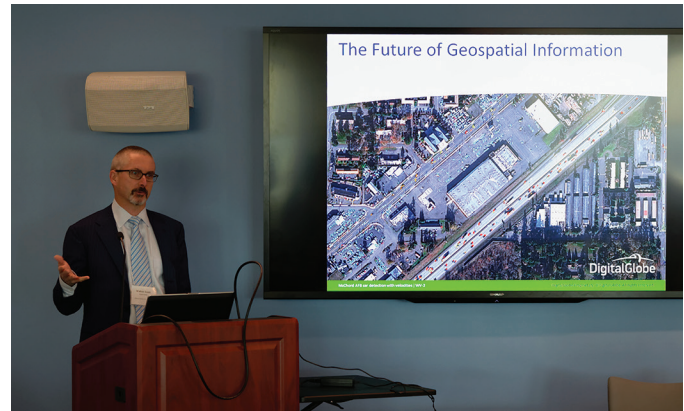
Figure 4. Walter Scott, founder of DigitalGlobe, focuses on the future of geospatial information.

Satellite imagery is not free, but it appears free to most people who view it. The technology is driving demand for “show me where” over “show me what.” Big themes include source proliferation, data normalization, and open platforms.