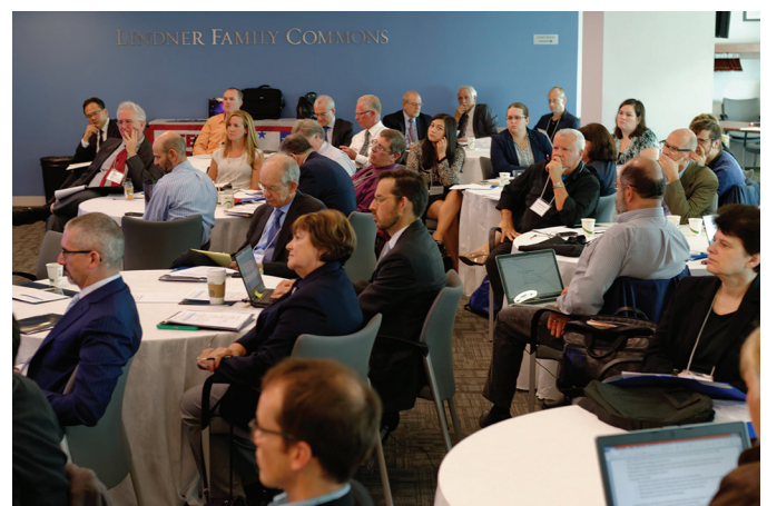
Figure 1. Workshop attendees listen to presentations.