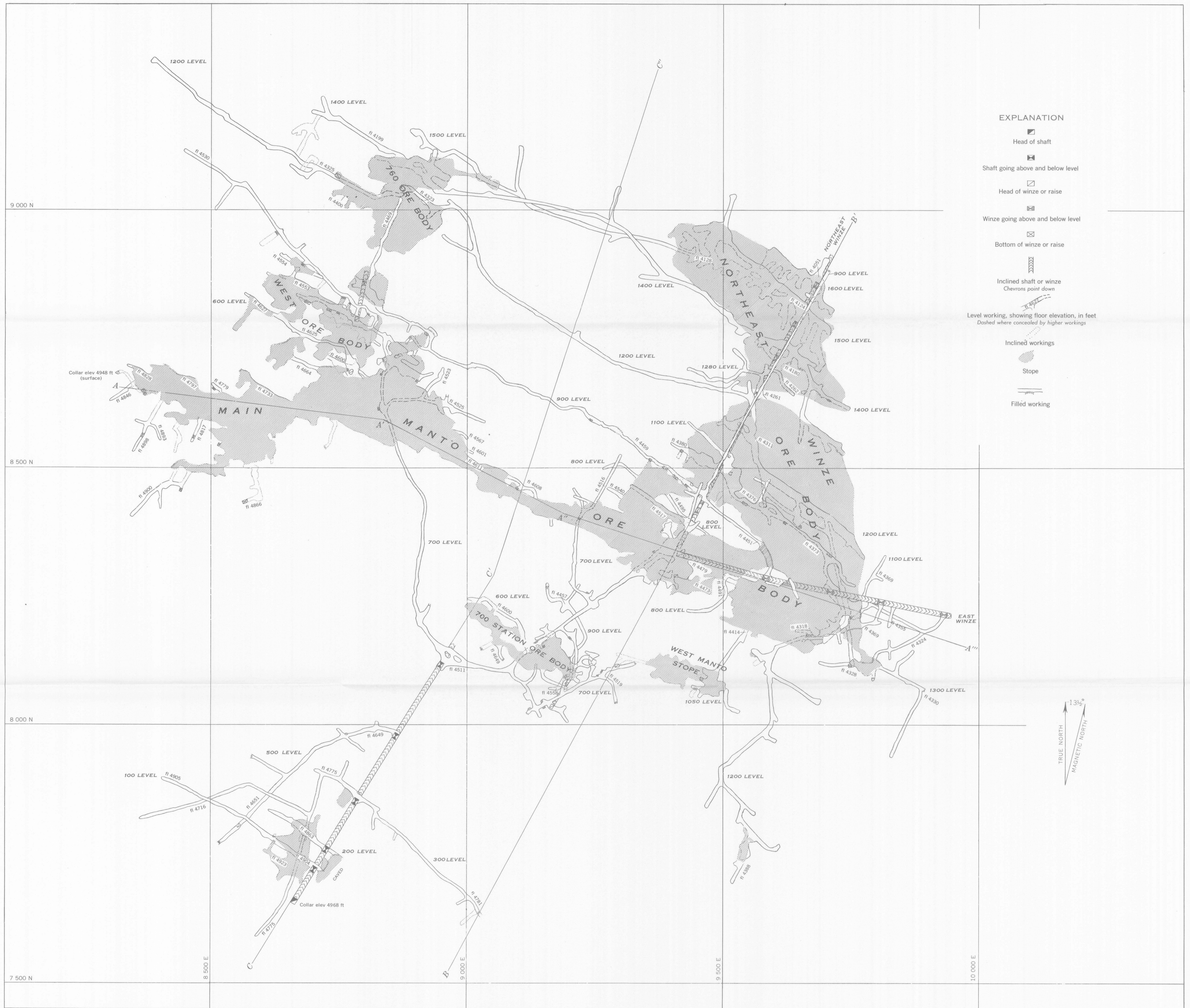
COMPOSITE LEVEL MAP OF REPUBLIC MINE, COCHISE COUNTY, ARIZONA, SHOWING STOPES ORE PILLARS AND SOME LEVEL WORKINGS OMITTED FOR CLARITY