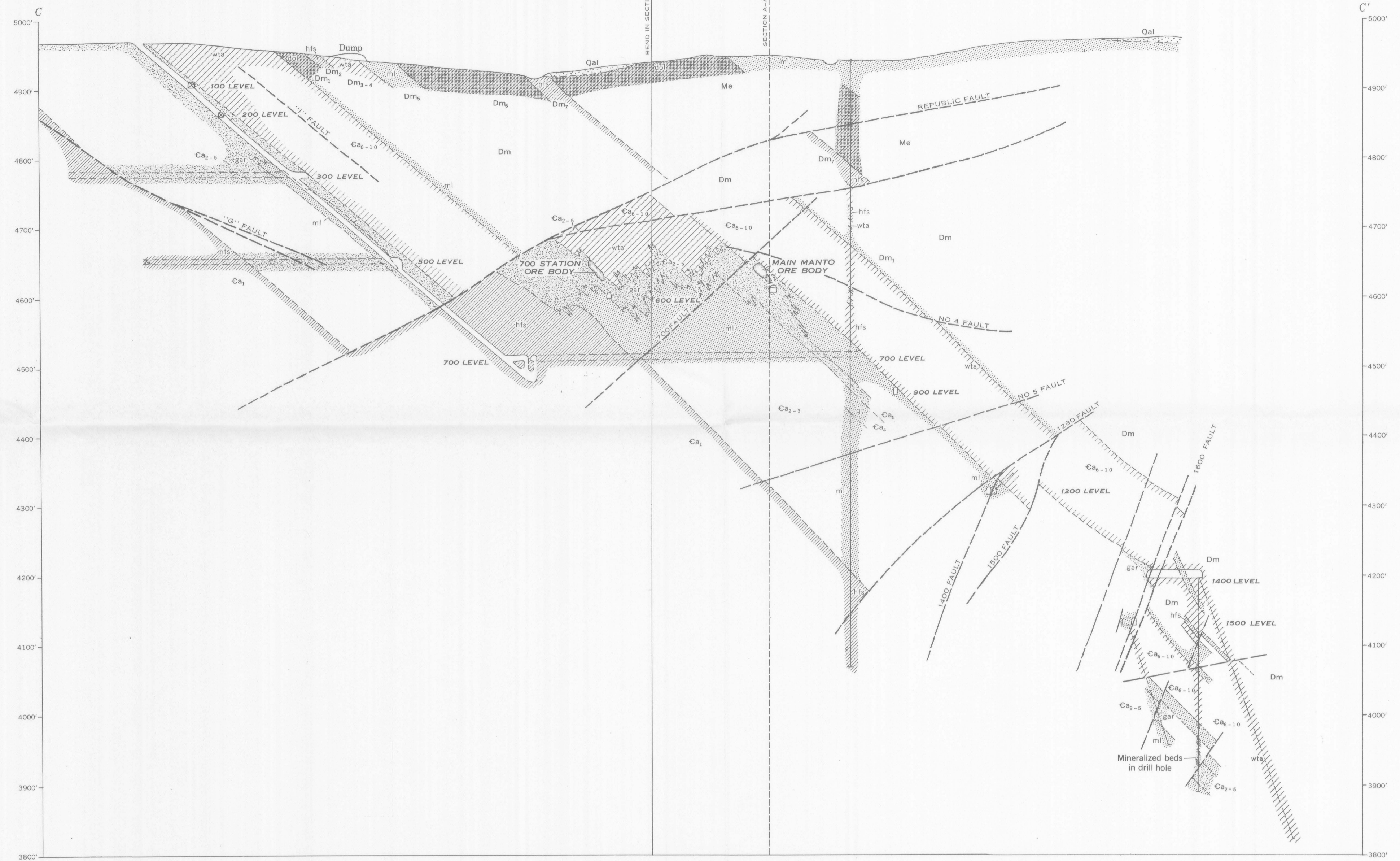
C-C', THROUGH SHAFT