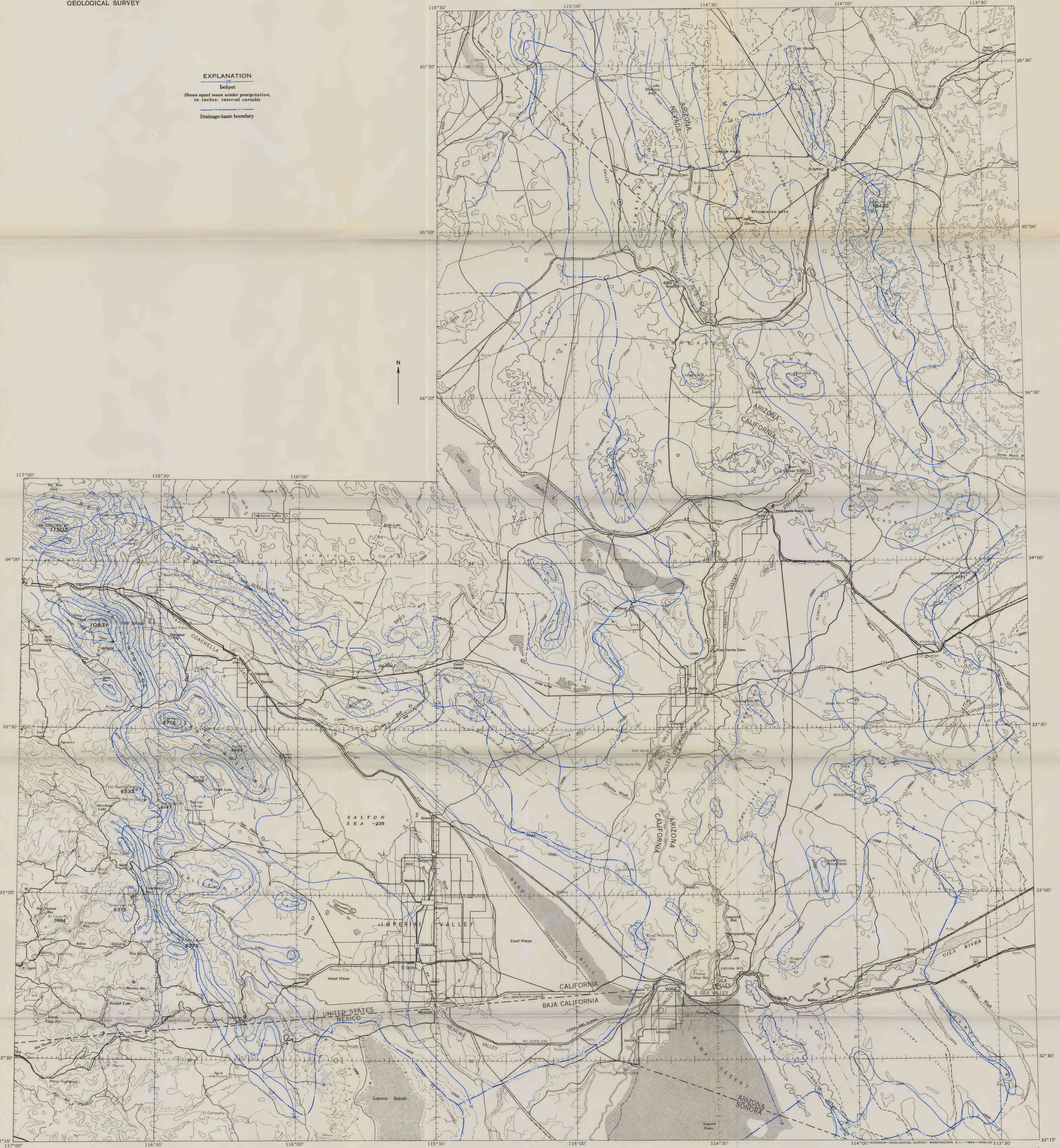
MAP SHOWING MEAN WINTER (OCTOBER-APRIL) PRECIPITATION, 1931-60, LOWER COLORADO RIVER-SALTON SEA AREA