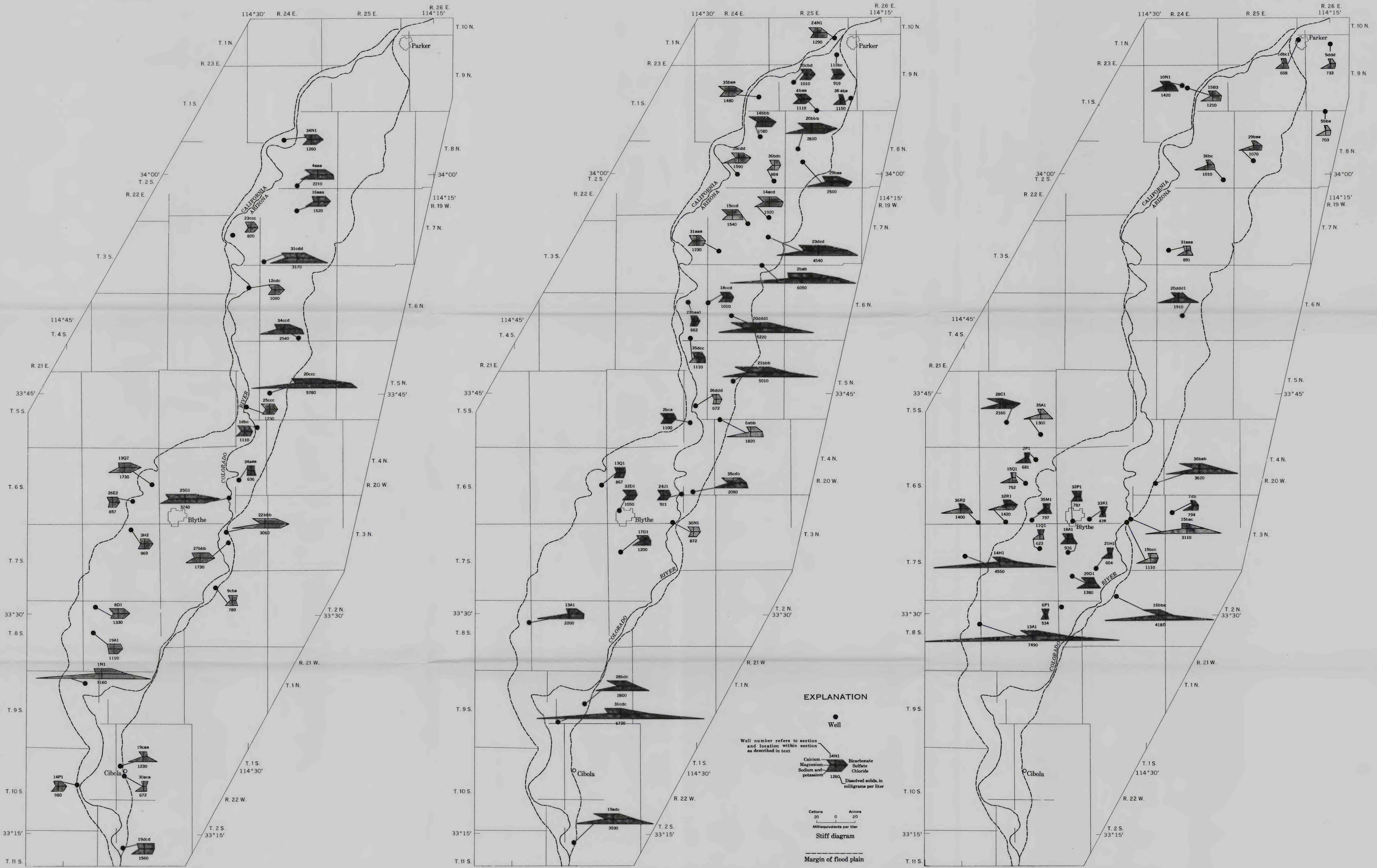
SHALLOW ZONE UNDERLYING THE FLOOD PLAIN