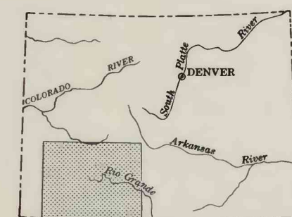
INDEX MAP OF COLORADO SHOWING AREA OF THIS REPORT

Showing the configuration of the San Juan peneplain. Contours dashed where projected beneath alluvial fill. Hachures indicate closed depression. Contour interval 500 feet. Datum is mean sea level