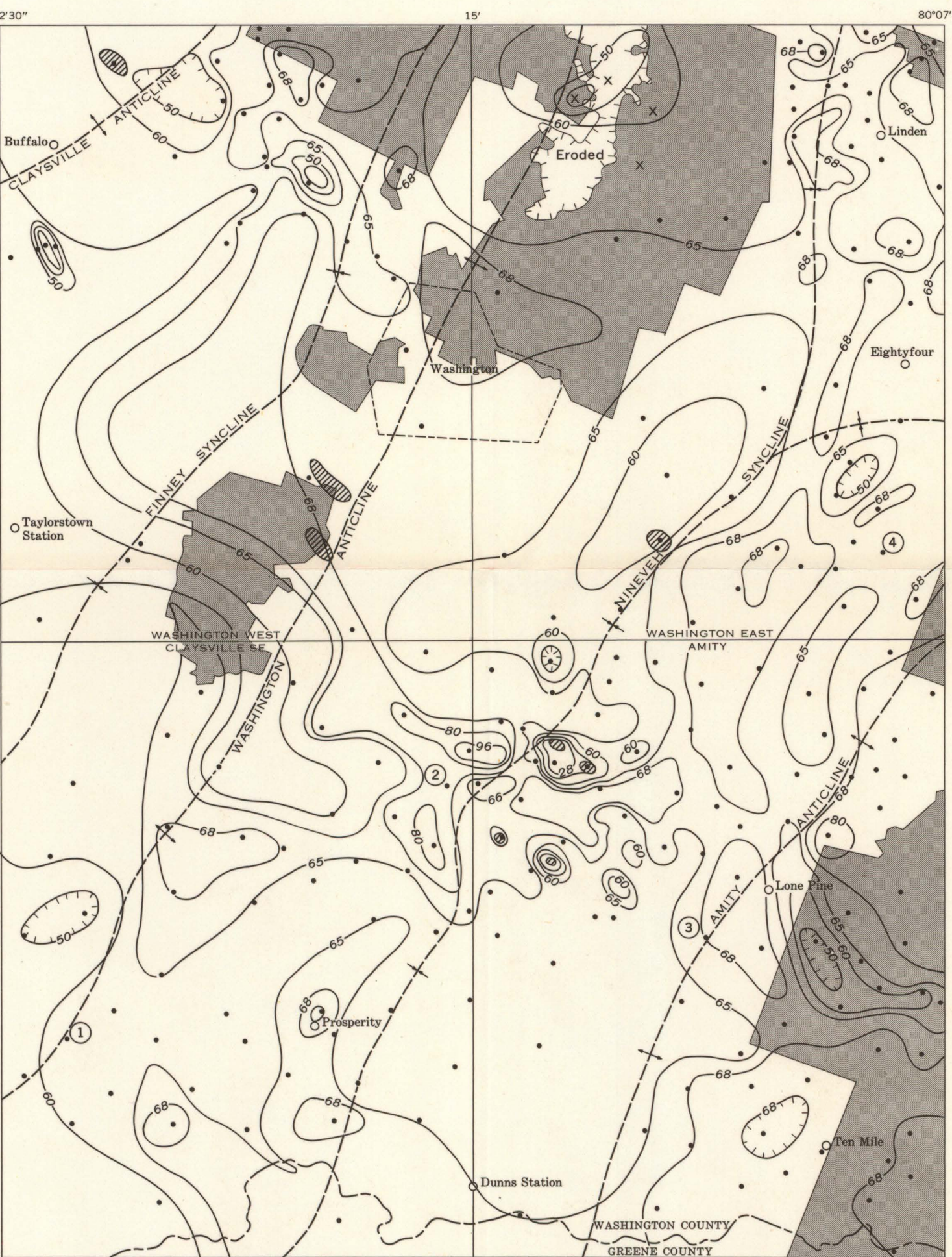
A. LOWER BENCH