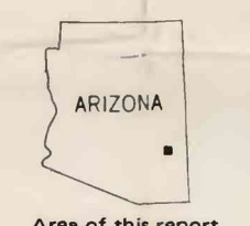
VEGETATION MAP OF THE GILA RIVER PHREATOPHYTE PROJECT