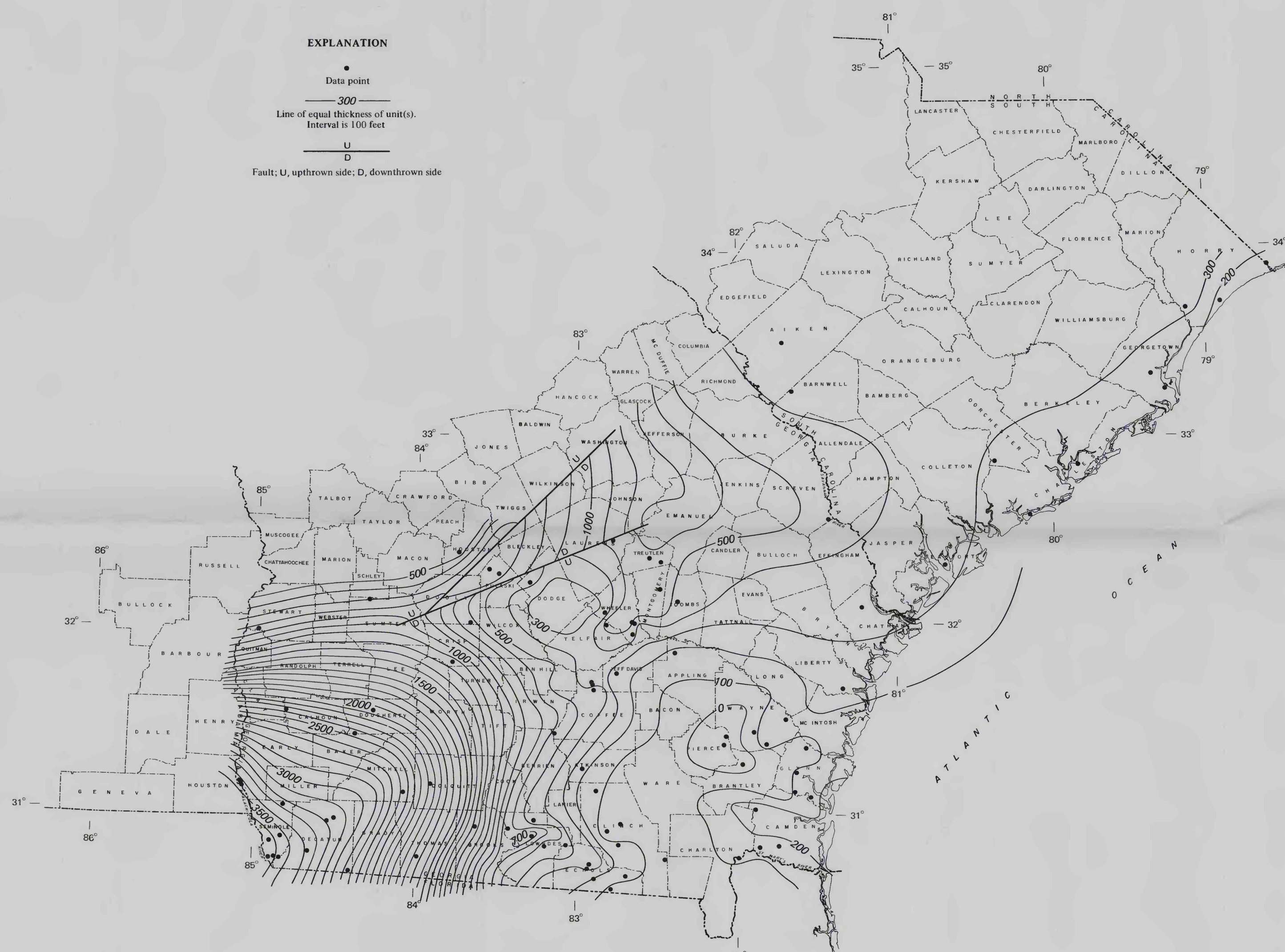
B. THICKNESS, UNITS F THROUGH H(?)