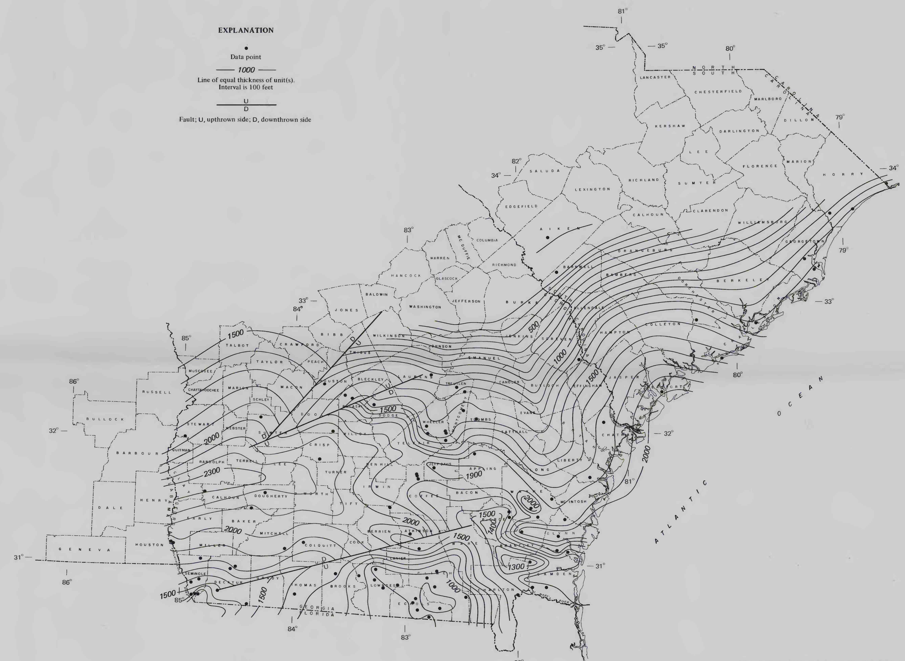
C. THICKNESS, UNITS A THROUGH E

Base from U.S. Coast and Geodetic Survey