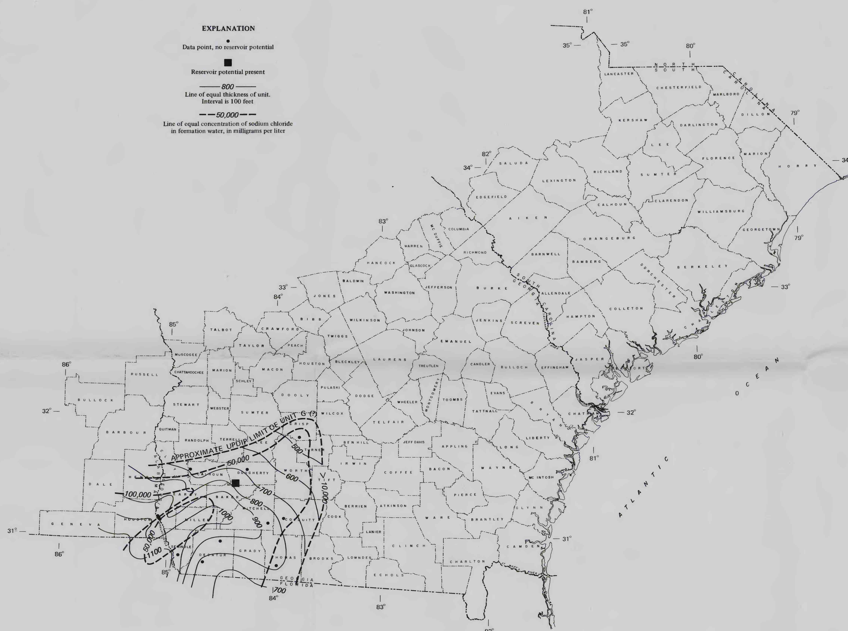
B. THICKNESS AND SODIUM CHLORIDE CONCENTRATION OF UNIT G(?) IN AREA OF NON-USEABLE GROUND WATER